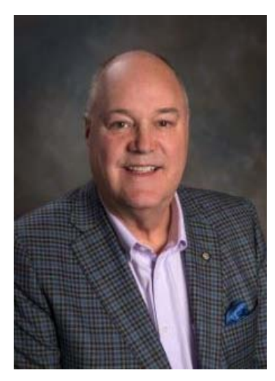
111th Rotary President

ROTARY MEETING Friday - May 2nd 12 Noon - 2PM Chattanooga Convention Center Multi-District Conference RESERVATIONS REQUIRED